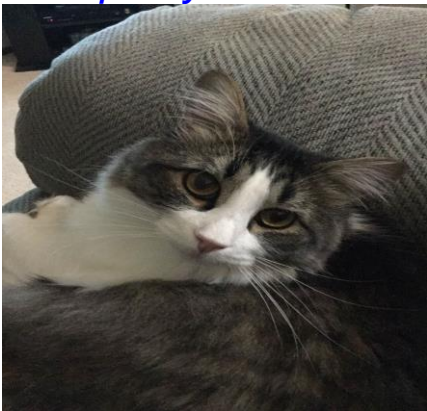
Cats don't work....don't be like cats!

The opportunity is here, the commitment and motivation are up to you!